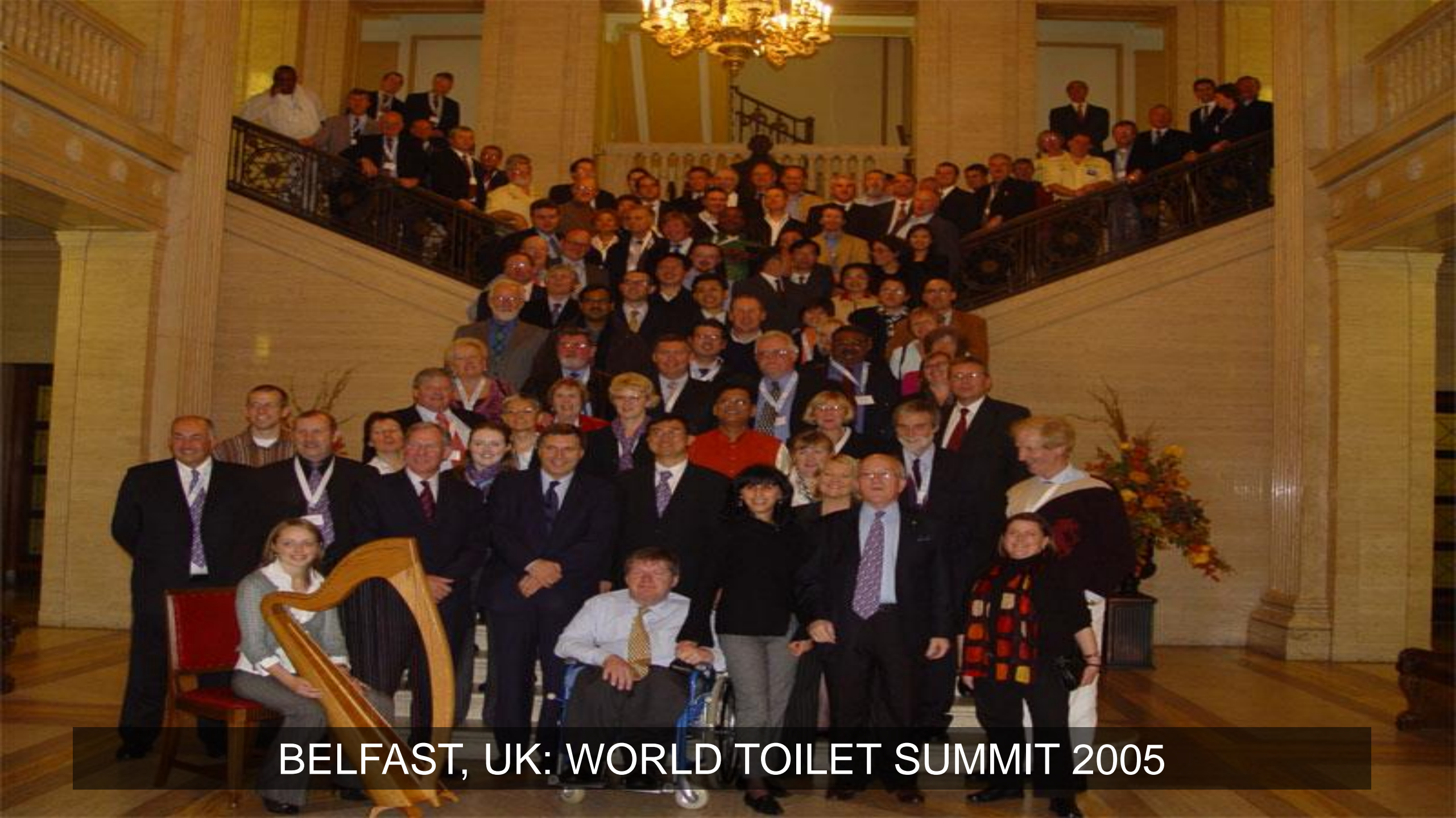
BELFAST, UK: WORLD TOILET SUMMIT 2005