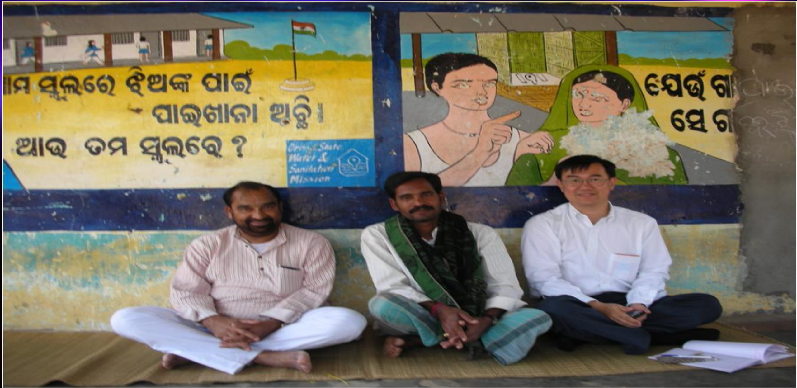
We'll Not Marry Our Daughters to Families Without Toilets